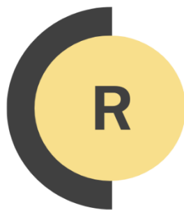
Figure 1: The Reflection, Objective, Movement and Action (ROMA) Model ® : A Framework for Restorative Supervision