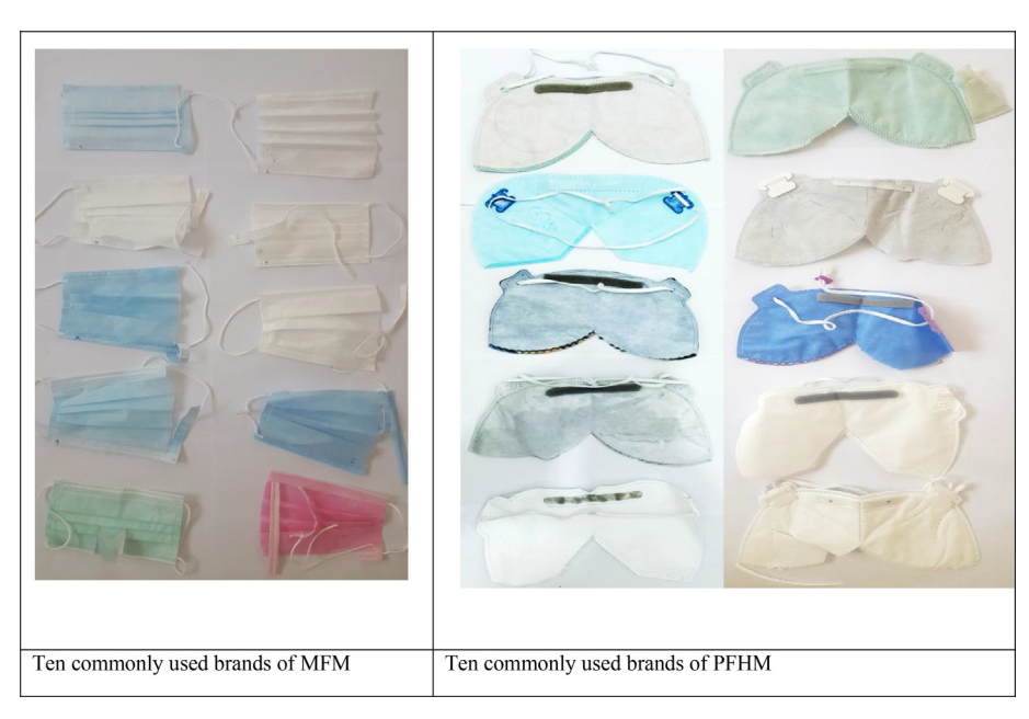
Fig. 2. Illustration of MFM and PFHM masks assessed in this study.

Six samples from 10 brands of MFM and 10 brands of PFHM were evaluated using the MQAT. There was consistency across the six samples used for each brand in the study. The results are reported in Table 2 and Table 3, respectively, with illustrations in