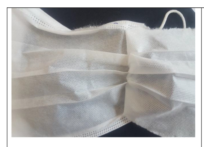
a) Non-compliance with MQAT item 14: Comprised of at least three layers. This is a double layer mask.