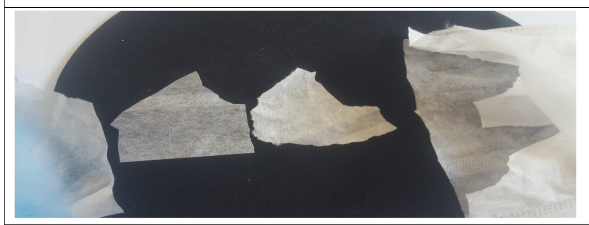
d) Examples of compliance and non-compliance with MQAT item 20: Confirmation (initial) of the quality of meltblown layer using the bottom surface visibility test

c) Non-compliance with MQAT items 31: The connection of the nose clip is not contained inside the layers (visible on the outside of the layer) Particle Filtering Half Mask.