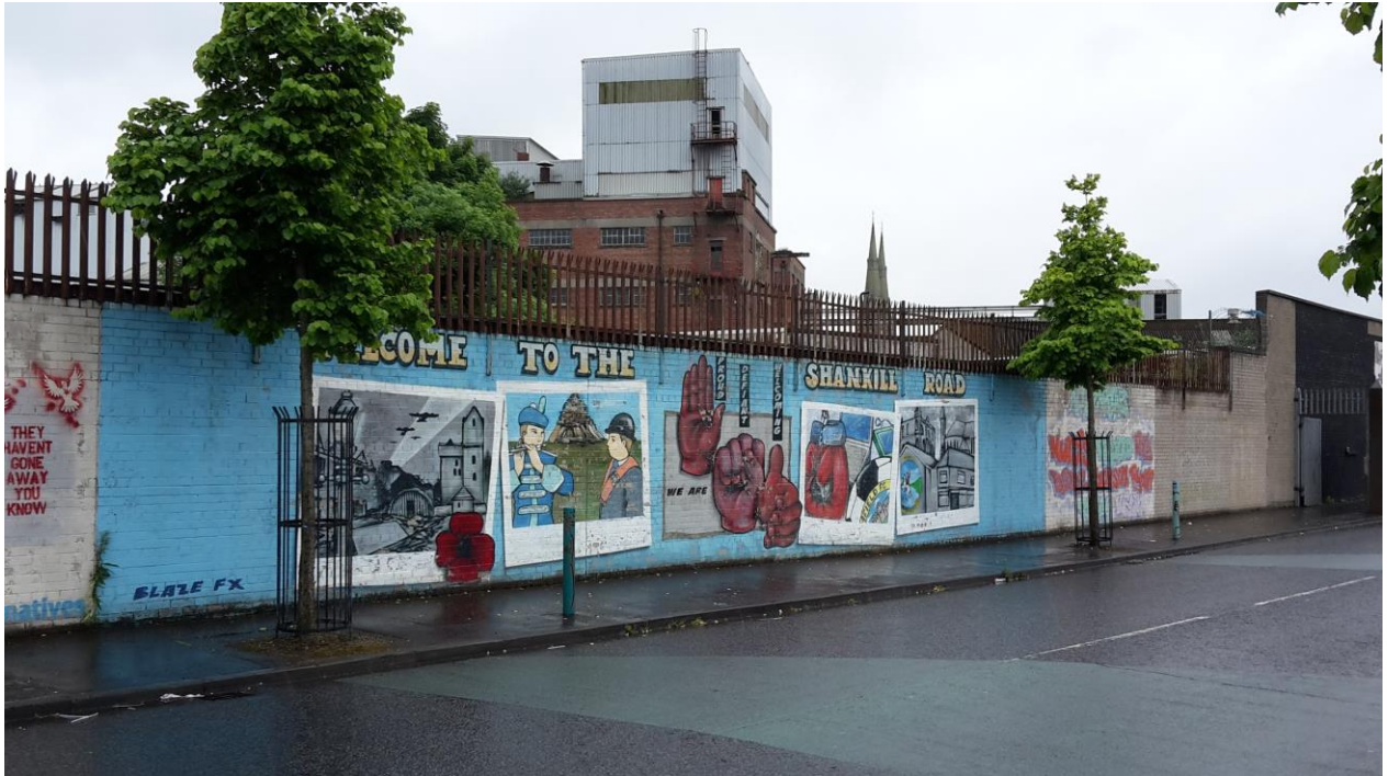
Fig. 2. 'Welcome to the Shankill Road' mural, Northumberland Street, Belfast, 2016.