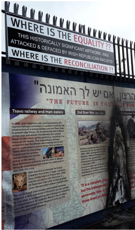
Fig. 6. Sign alleging 'racist' attack on 'Patterson' mural, Northumberland Street, Belfast, 2016