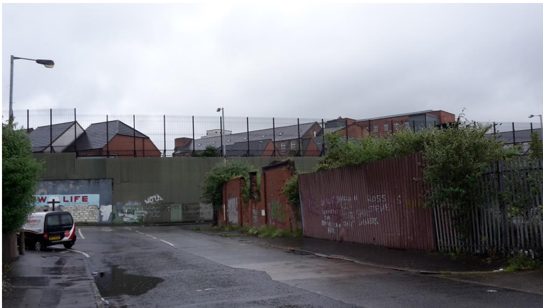
Fig. 1. Peace walls dividing the Falls and Shankill areas of Belfast, 2016.