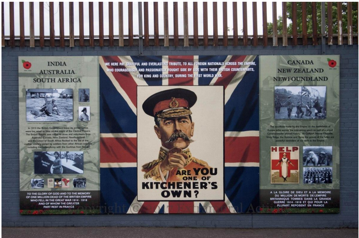
Fig. 5. 'Kitchener' mural, Northumberland Street, Belfast.