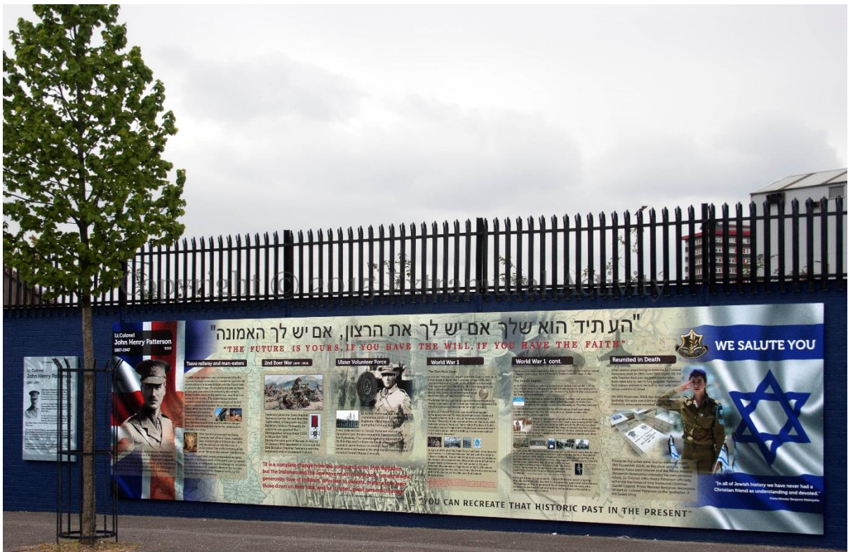
Fig. 3. 'Lt. Col. John Henry Patterson' mural, Northumberland Street, Belfast.