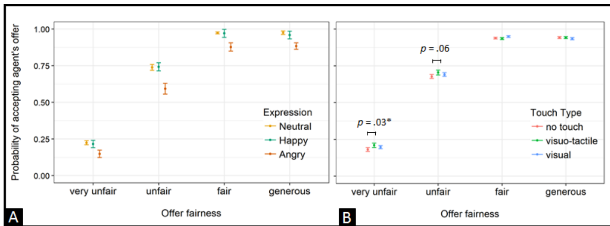
Figure 2. Interaction effects of expression and offer (panel A) and touch and offer (panel B) on compliance. The least square means of log-odds were back-transformed to probability, and the error bars indicate the standard errors of the planned pairwise comparisons between angry vs. neutral/happy (panel A) and no touch vs. visual/visuo-tactile (panel B) at each level of offer.

visuo-tactile resulted in higher probability of accepting very unfair offers than when no touch was delivered ( p = .03 , OR = 1.20 , 95% CI [1.16, 1.28]). No significant difference was found between the visual and no-touch conditions ( p = .29 ). While the persuasiveness of visuo-tactile touch ( M = 70 , SE = .02 ) vs. no touch ( M = 68 , SE = .01 ) was also present in somewhat unfair offers, it failed to reach significance ( p = .06 , OR = 1.13 , 95% CI [1.13, 1.16]). Moreover, no significant two-way interaction between touch and expression ( p = .08 ) or three-way interaction between touch, expression, and offer type was found ( p = .56 ).