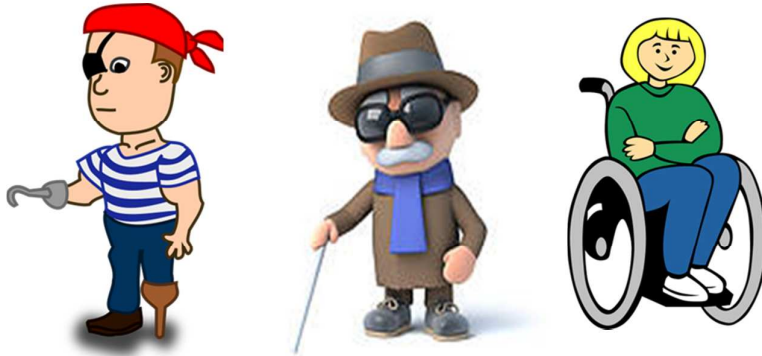
Figure 1- The Pirate Figure 2- The 'Blind Man' 'Easily Assimilable' Disability