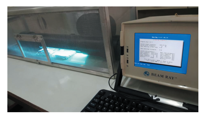
Figure 2. The pulsed electromagnetic field system where the Ar-filled plasma tube is placed inside a Faraday aluminium cage with the microwell plates 2.5 cm below the plasma tube.

In order to provide support for the investigation, the in vitro methodology of preparing the breast cancer cell samples was modelled using perfusion techniques already prepared by the Molecular Science Unit of De La Salle University, Philippines. In essence, the samples used were a replication of the in vivo phenotype. These samples were equally placed in each well of five 96-microwell plates (8 rows×12 columns) – four for the treatment group and one for the control group – with 25 µl of cells placed in each well at approximately 70% confluence. The cells to be treated with PEMF were placed inside a mesh or Faraday cage that was targeted by modulating resonant frequency propagated by a 3.3 MHz carrier frequency. To minimise collateral exposure of the neighbouring samples, aluminium foil was placed on the microwell plate to cover it, as shown in Figure 1.