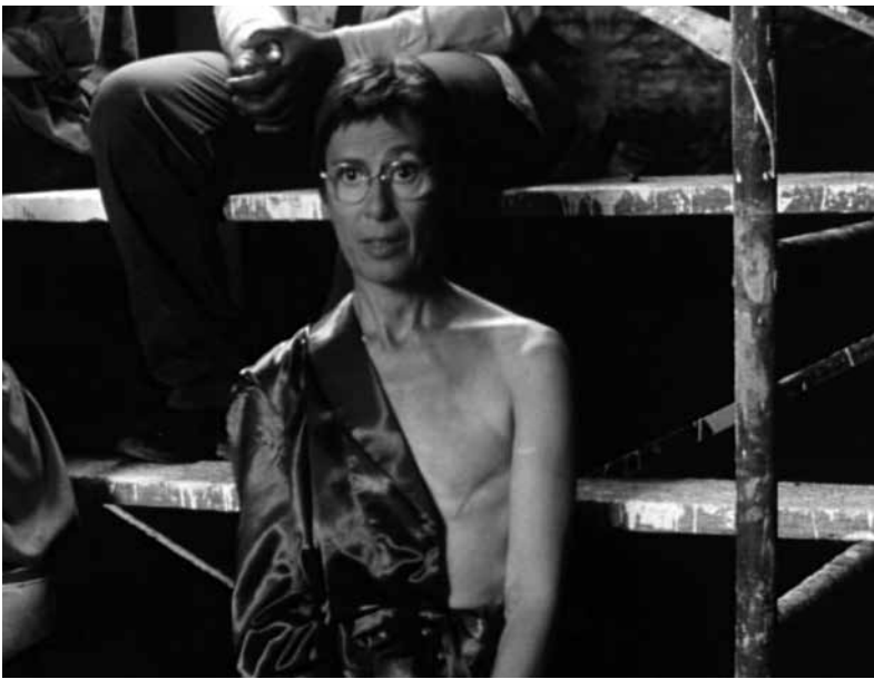
■ MURDER and murder. Director Yvonne Rainer. Rainer as 'the next contender' sits on the scaffold in front of the ring and addresses the camera in a scene from 'Shrinkage'. Zeitgeist, 1996.